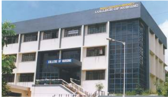
College of Nursing, Pune