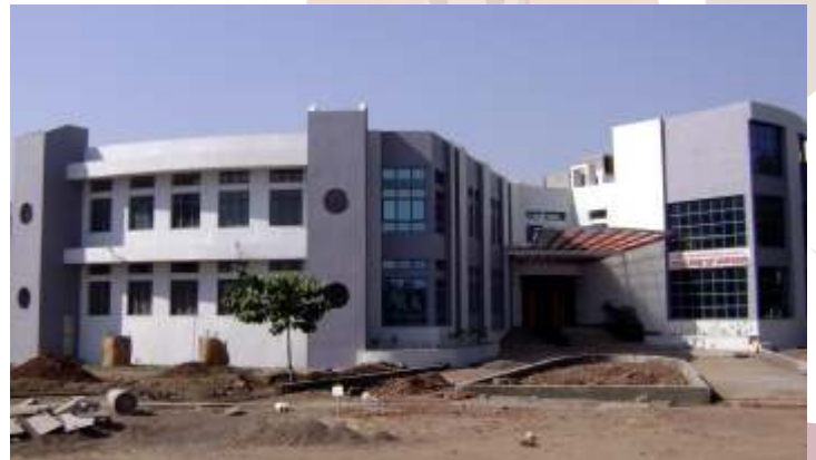
College of Nursing, Sangli