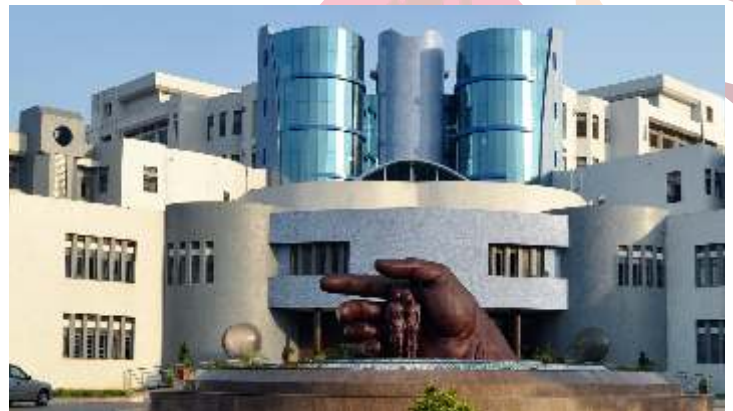
Bharati Hospital, Sangli