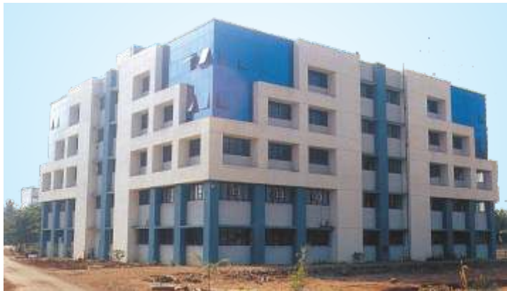
College of Nursing, Navi Mumbai